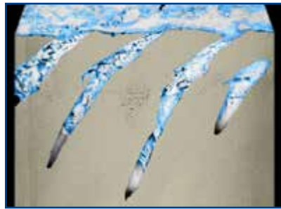
Novel data fusion image combining 3D imaging data overlaid with DSIMS stannous data (blue) from the same