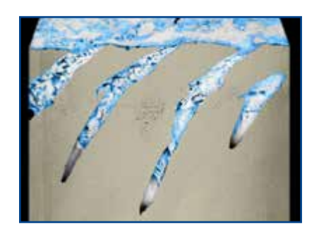
Novel data fusion image combining 3D imaging data overlaid with DSIMS stannous data (blue) from the same